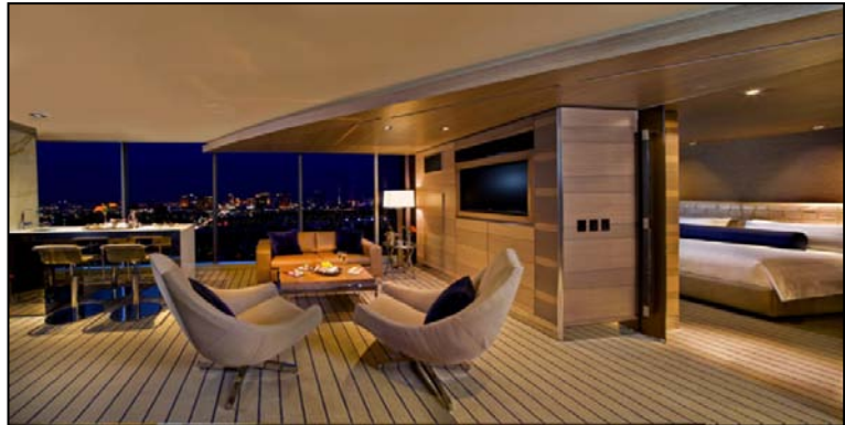
Luxury suites at Nevada's M Resort. At left, a loft suite; above, a flat suite.