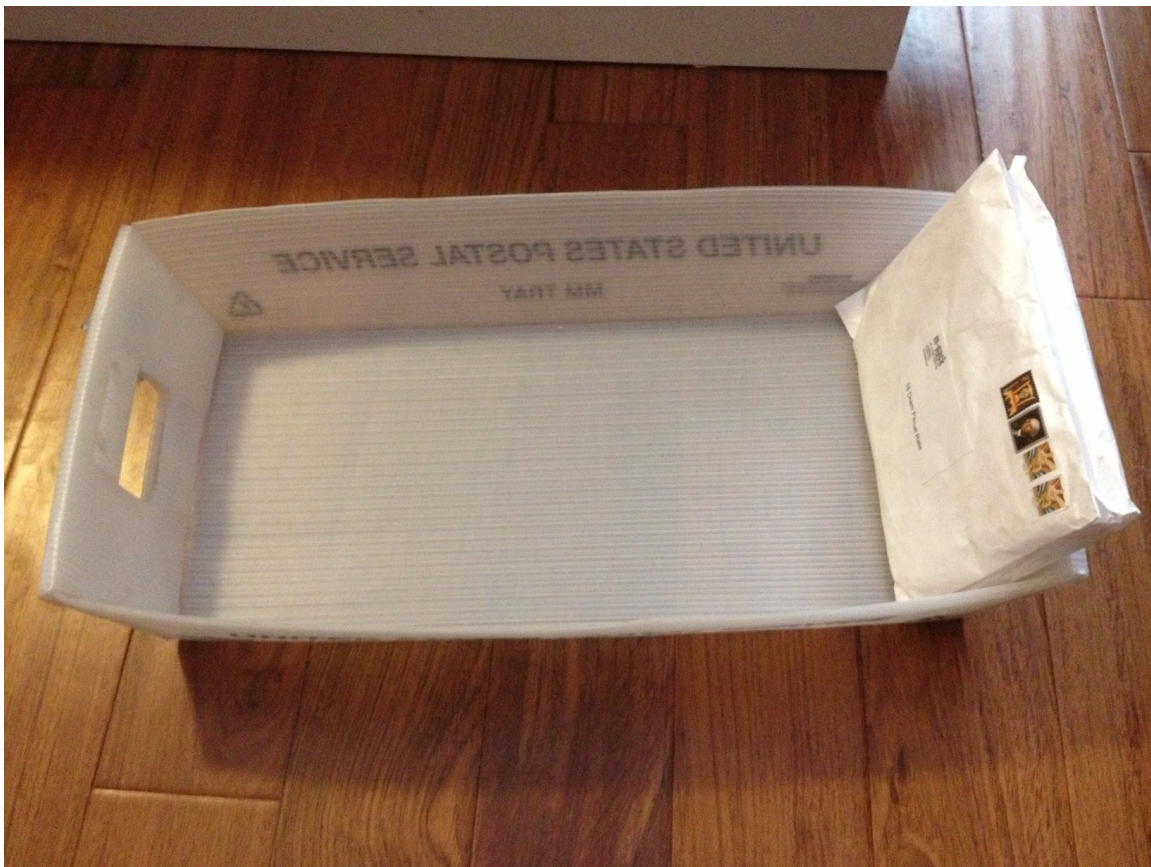
Figure 1. Mpack Mailer Can be Sequenced by Zipcode and carrier at Point of Mailing

Traditional round vial packaging doesn't allow for sequencing at the point of fill like the m-pack® mailer, so additional sorts are required between the source and the consumer. The flat mailer allows for prescriptions to be sequenced at the point of fill and maintain that integrity all the way through the postal process.