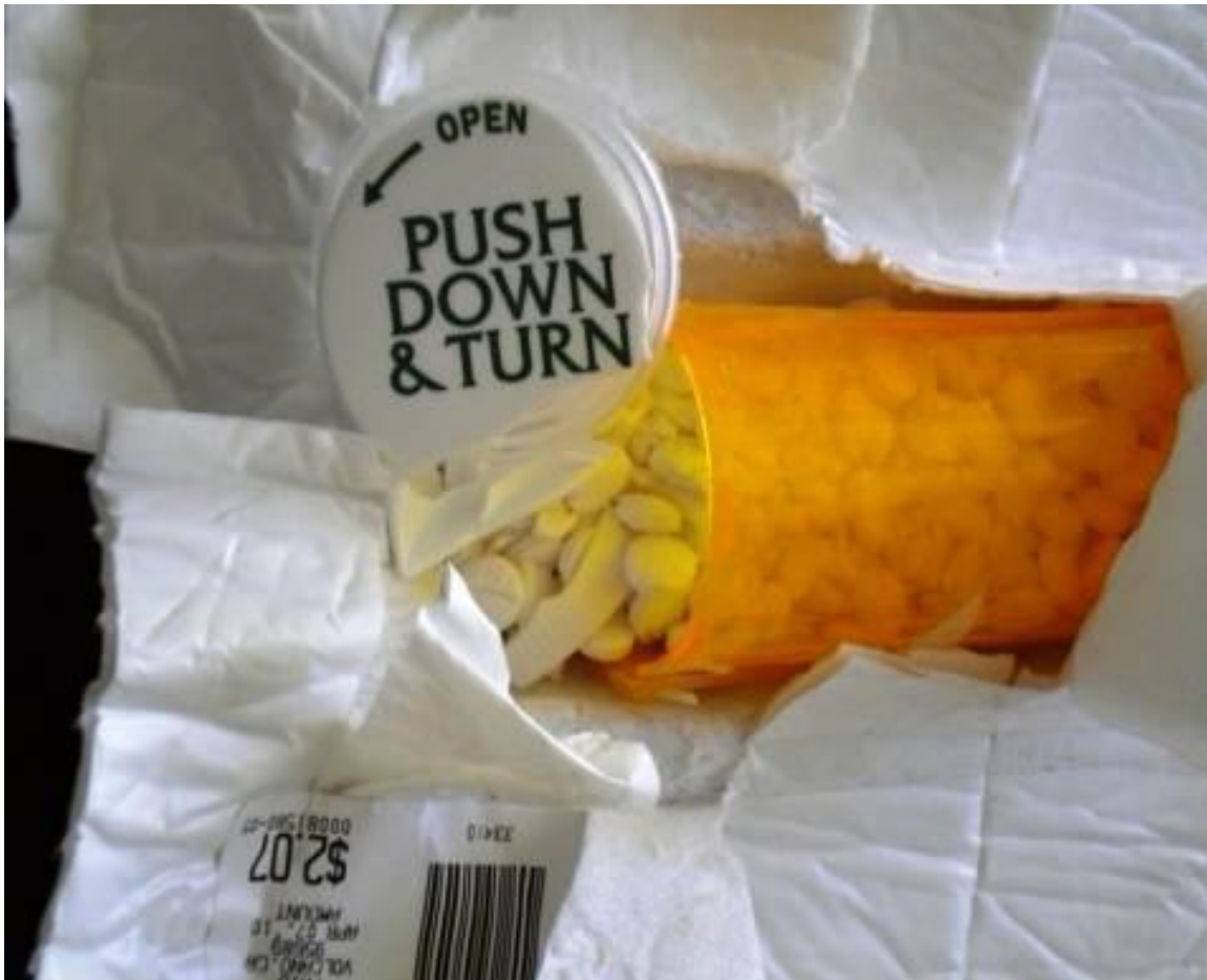
Figure 2. "Pop-Offs" Are an Issue in the Mail

There are two additional issues with traditional round vials when shipped through the mail,