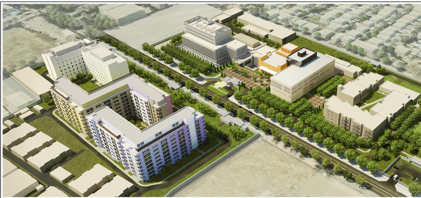
Figure 1: U.S. Embassy Kabul, Compound upon Construction Completion a