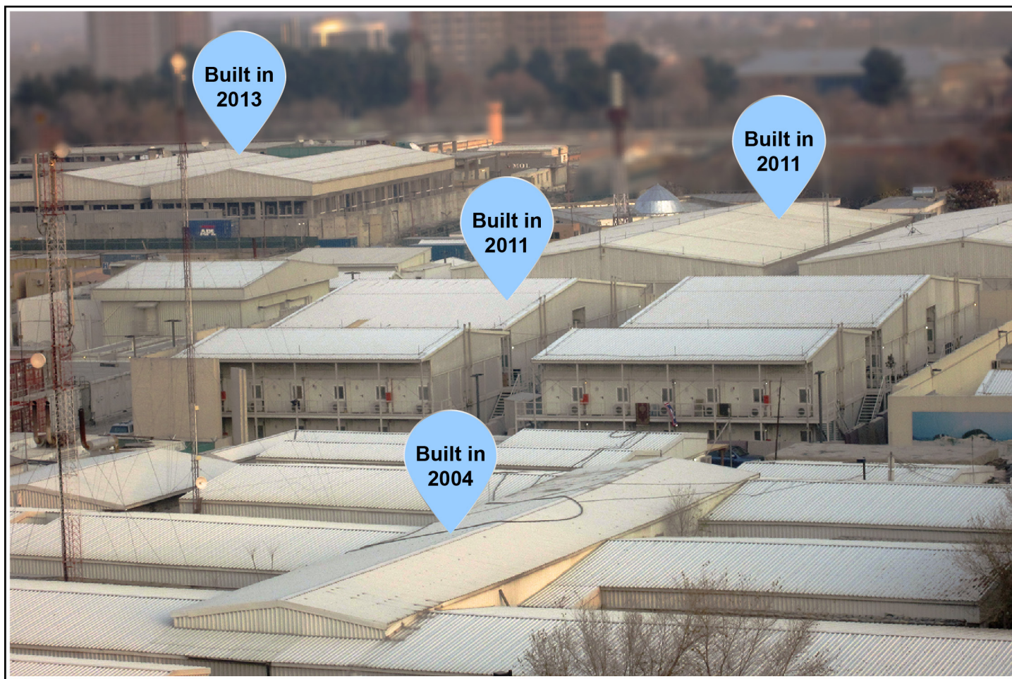
Figure 3: U.S. Embassy Kabul, Temporary Facilities

Based on numbers provided by State, as of February 2015, temporary facilities on the embassy compound provided nearly 1,100 desks and 760 beds. Figure 3 shows some of the temporary facilities that the post has used to meet interim space needs.