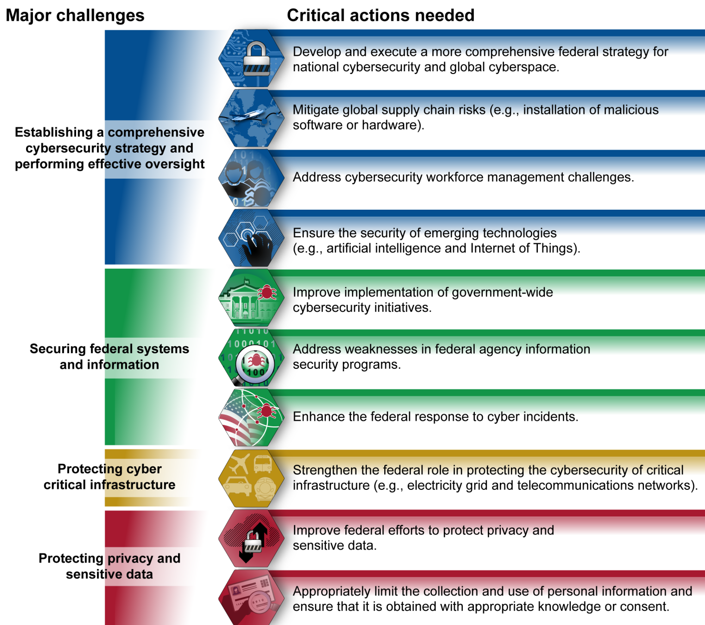
Figure 4: Ten Critical Actions Needed to Address Four Major Cybersecurity Challenges