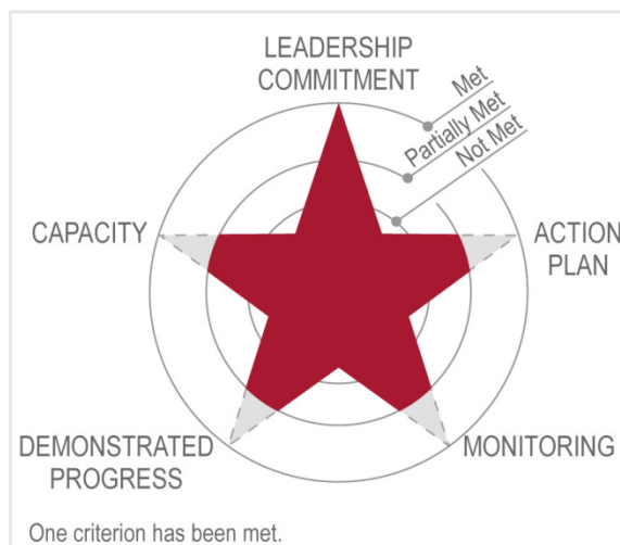
Figure 3: Status of High-Risk Area for Ensuring the Security of Federal Information Systems and Cyber Critical Infrastructure and Protecting the Privacy of Personally Identifiable Information, as of February 2017

As we reported in the February 2017 high-risk report, 21 the federal government's efforts to address information security deficiencies had fully met one of the five criteria for removal from the High-Risk List—leadership commitment—and partially met the other four, as shown in figure 3. We plan to update our assessment of this high-risk area against the five criteria in February 2019.