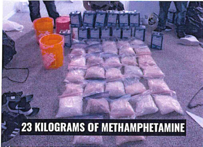
23 KILOGRAMS OF METHAMPHETAMINE