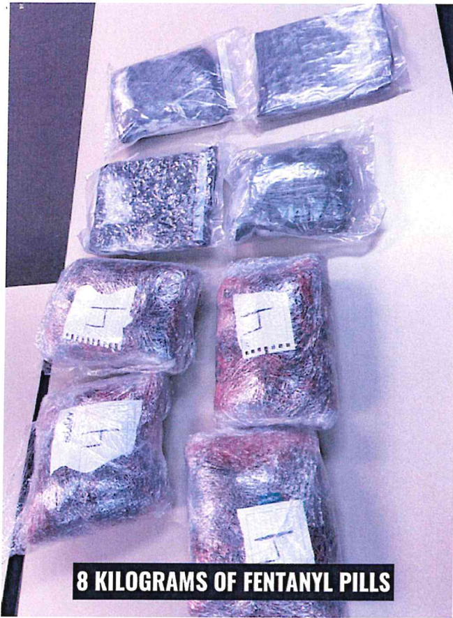
8 KILOGRAMS OF FENTANYL PILLS