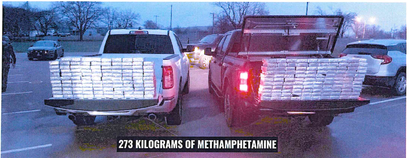
273 KILOGRAMS OF METHAMPHETAMINE