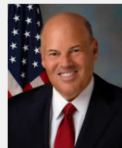
Louis DeJoy, Postmaster General

from criminal activity and securing the mail from criminal misuse and attack.